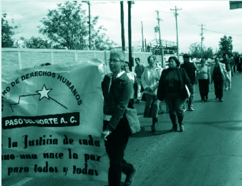
“Peace is born for all of us, from justice for each of us” © “Paso del Norte” Human Rights Center

del Norte“ were under surveillance and harassed by the state Prosecutor and the Chihuahua state Ministerial Police. 75 They are aware that their level of risk is high and they fear harsher reprisals, due to the sensitive nature of the cases that they work on.