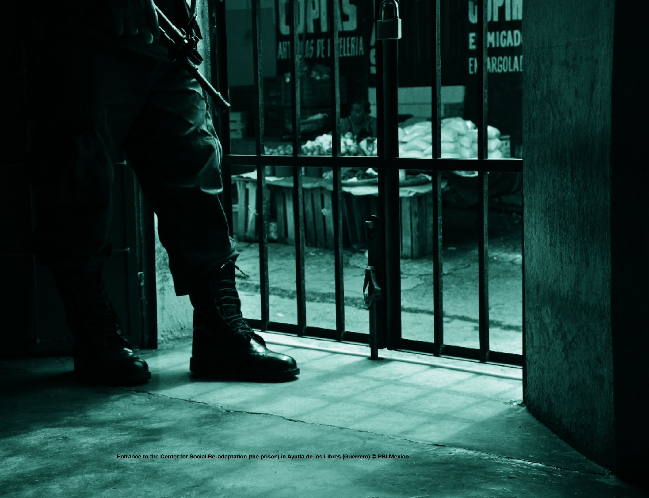
Entrance to the Center for Social Re-adaptation (the prison) in Ayutla de los Libres (Guerrero)