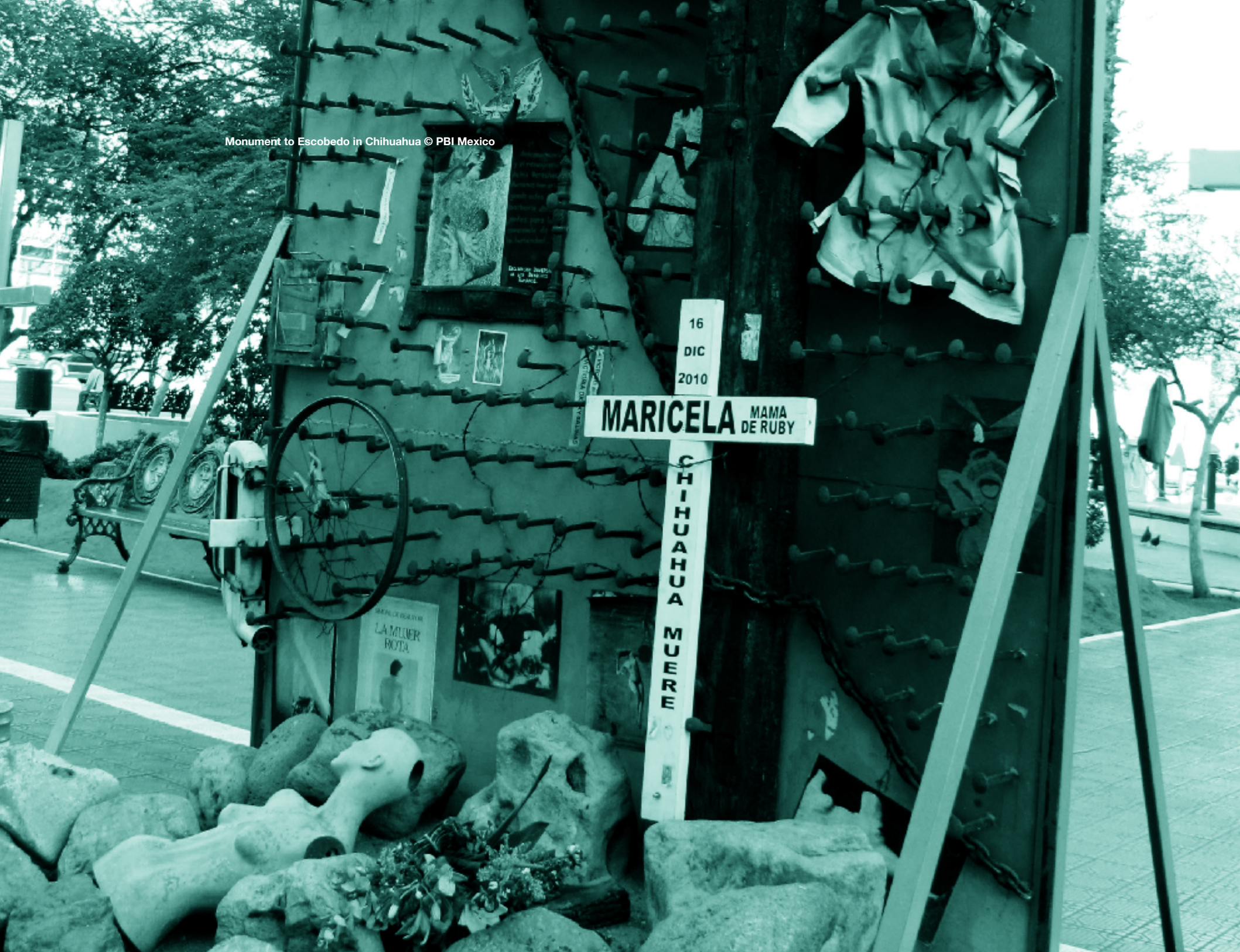
Monument to Escobedo in Chihuahua