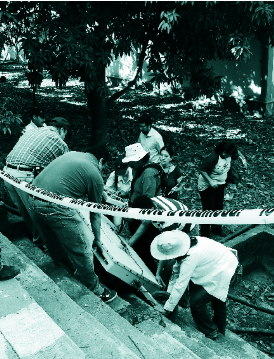
Scanning the soil at the former military barracks (today “City of Services”) in Atoyac de Alvarez (Guerrero)