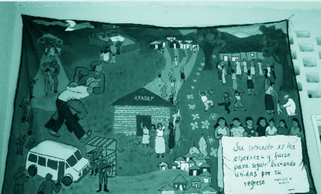
Women from AFADEM: “United for their return”