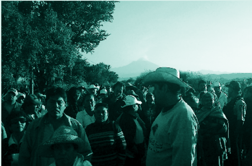
“The Guardian” in Huexca (Morelos)