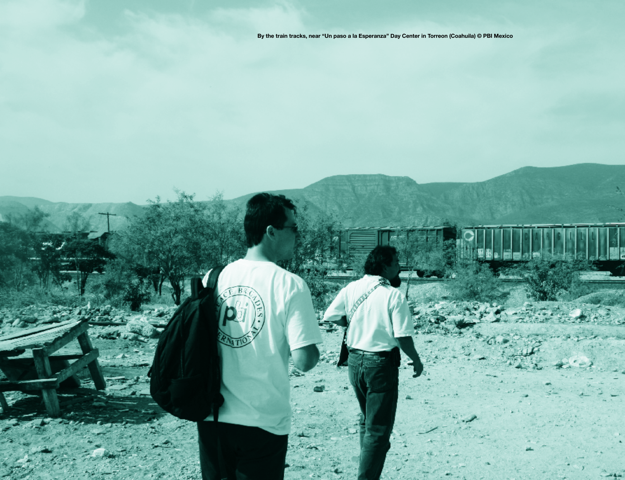
By the train tracks, near "Un paso a la Esperanza" Day Center in Torreon (Coahuila)