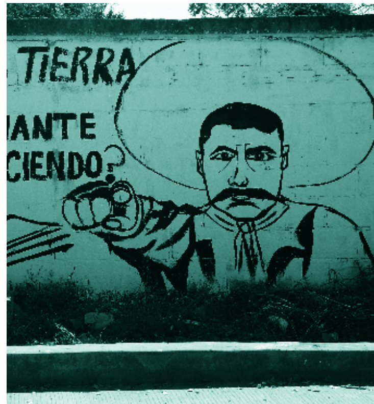
“I defended the land”

Another international instrument is the Guidelines for Multinational Enterprises, which were adopted in 1976 by the Organization for Economic Cooperation and Development (OECD). This document contains recommendations from the governments to the businesses that operate in or come from member states. Since May 2011, the Guidelines inclu-