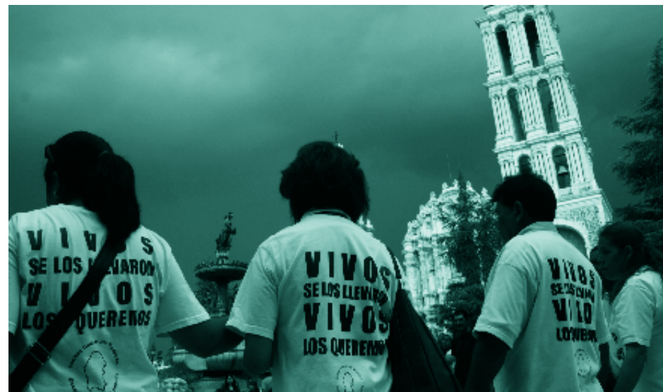
“They were taken alive, we want them alive”

vestigations to locate the victims. Many officials in the Public Prosecutor’s office tend to tell families that the person disappeared because they had connections with organized crime, in this way blocking the investigation: “It is impossible to determine the exclusive involvement of organized crime without a complete and consistent investigation,” say organizations.