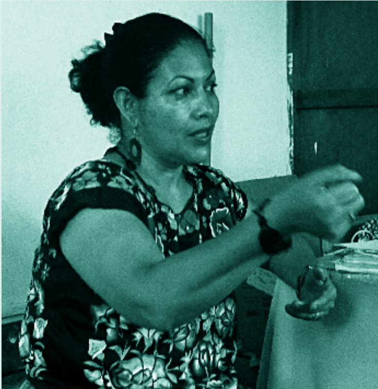
Bettina Cruz © PBI Mexico

Commission installed the first pilot project, La Venta I, 13 similar projects have also been installed in the region. Some of the affected communities are asking that their right to information and consultation be respected, and consider that the promises of development are not always fulfilled or do not always satisfy their needs.