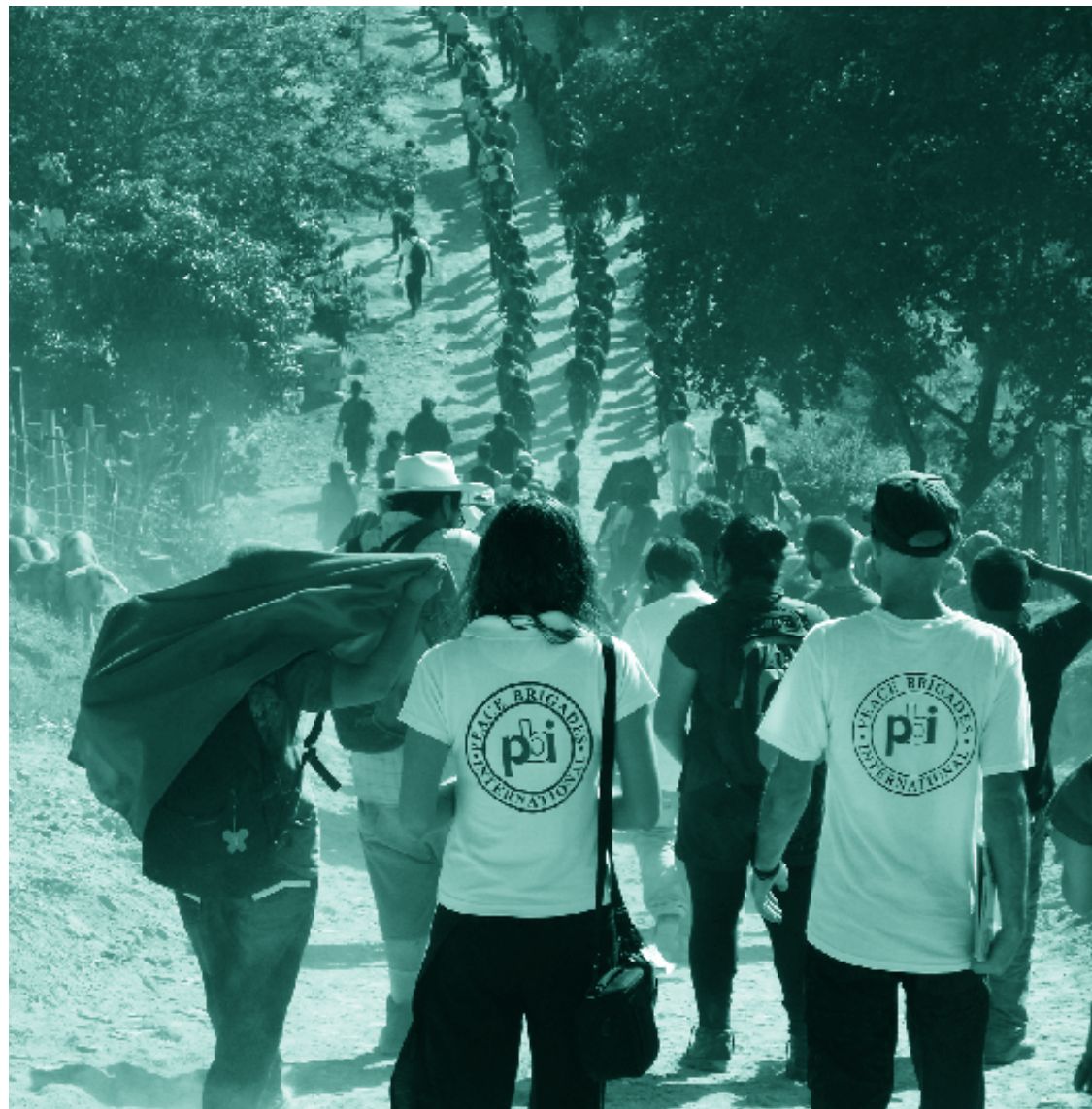
PBI accompaniment in Guerrero

This document, "A Panorama of the Defense of Human Rights in Mexico" is a collection of the voices of the organizations that PBI met with during the exploratory mission and the testimonies of human rights defenders that work in these states. The goal of the report is to recognize and provide visibility to those initiatives that work to promote a respect for human rights in Mexican civil society. By distributing this report, we hope to have an impact on the violence and human rights violations faced by social movements in Mexico and the causes that they defend. The cases and the problems that are portrayed in this publication span many issues, from the defense of civil and political rights, to economic, social, cultural and environmental rights. The circumstances that human rights defenders in these regions face because of the work that they do makes them potential candidates for PBI accompaniment.