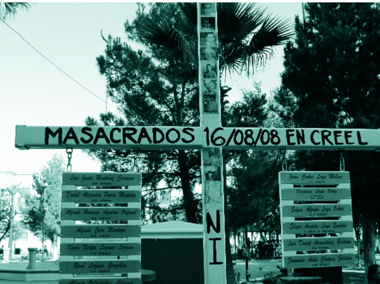
Monument to the victims of the “Creel Massacre” (Chihuahua)