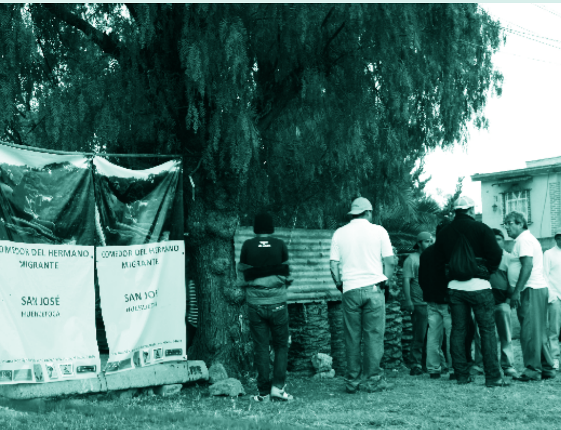
“San José” Huehuetoca soup kitchen (State of Mexico)

town hall did not carry out their responsibilities, not with the neighbors, nor with the shelter. The police trucks did not provide the necessary protection, they only came by the shelter to sign that they were there. Given the magnitude of the problem, there was a big lack of support.”