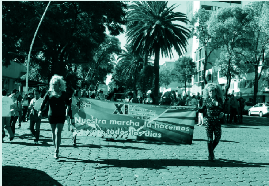
XI March for Pride, Dignity and Sexual Diversity in Puebla 2012