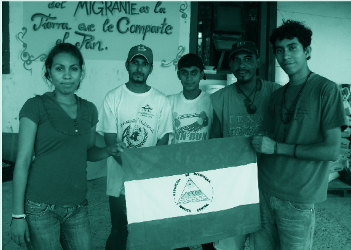
Migrants in the “Belen, Posada del Migrante” shelter (Coahuila)