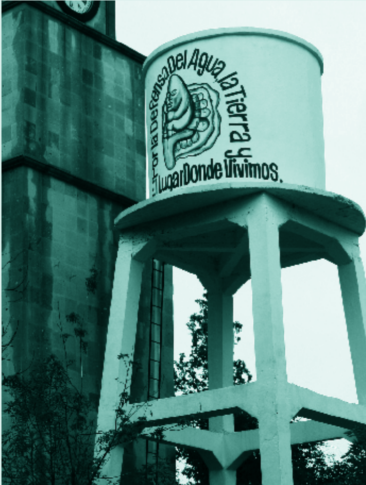
"For the defense of water, the land, and the place where we live"