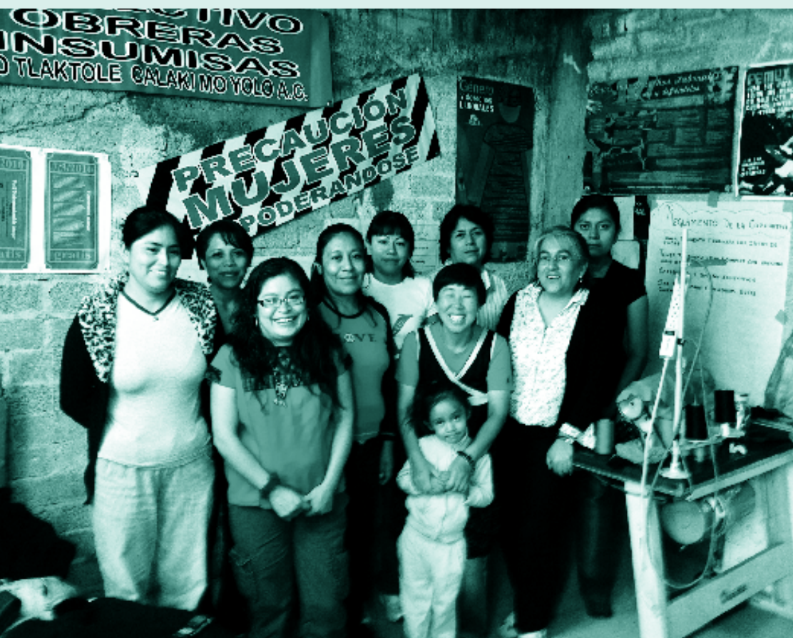
Caution: Empowering Women

The question of economic autonomy is not the only focus of the Collective. The organization also works on improving conditions for women workers. “Many of what threatens the women workers, in addition to the owner, the corrupt union, the work environment, is also the family environment. They can get training and everything but if they cannot