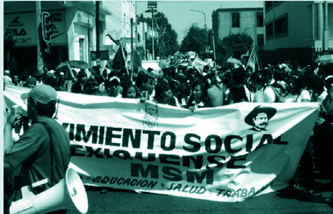
Mexiquense Social Movement: Education, Health, Work

for any of the schools when we began, we had to fight to obtain official recognition from the authorities. It has been a very long struggle, we are talking about 22 years in which these demands for services have progressed very slowly.” The group was able to get all the communities to provide space for the schools.