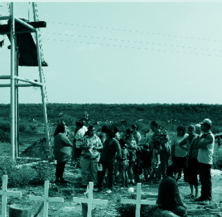
In memory of the miners killed in Pasta de Conchos (Coahuila)

15 workers at a time. Of the 115 companies that have or have had contracts with PRODEMI [Promoter for Mining Development, a state run agency that is an intermediary between the businesses and the CFE], 74 have less than 15 workers. There are companies that have contracts for thousands of tons [of coal] and they have four workers.”