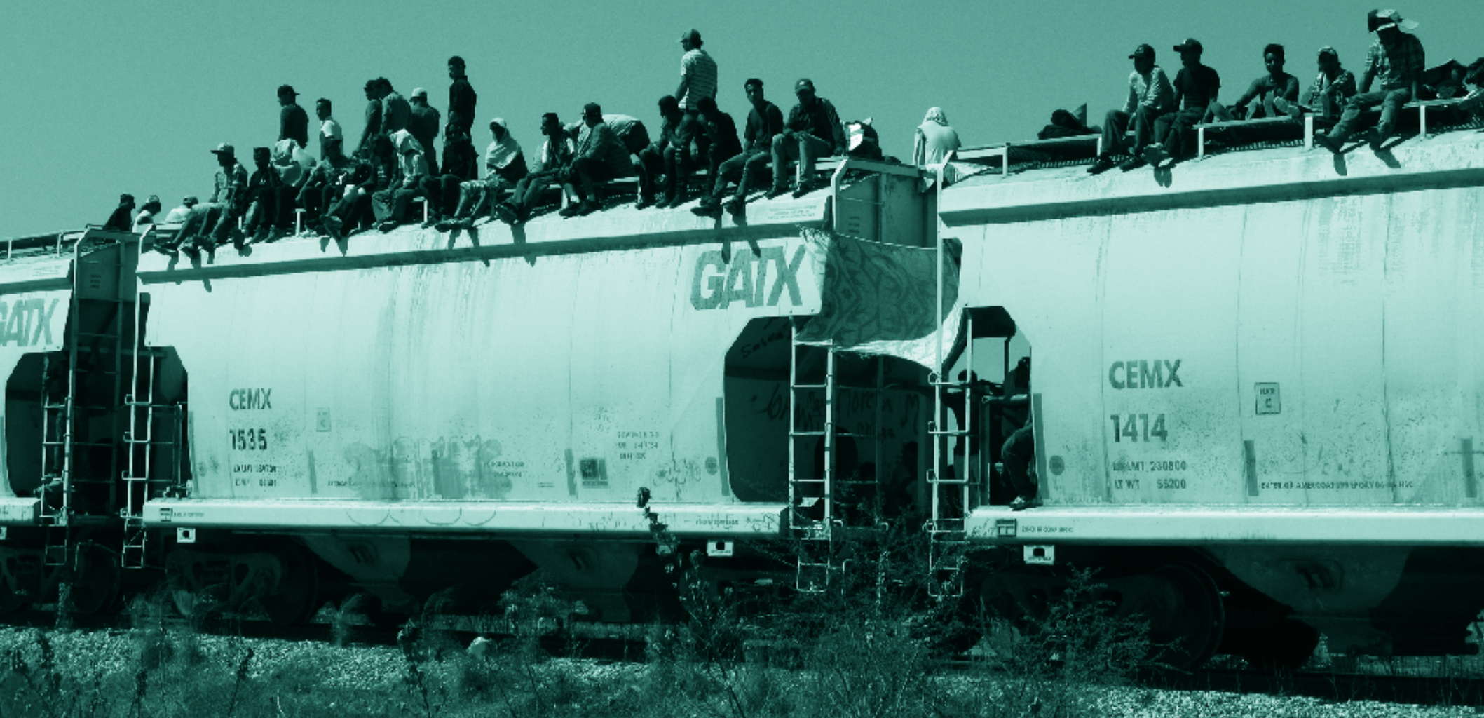
"The Beast" makes its way through the Isthmus of Tehuantepec (Oaxaca)