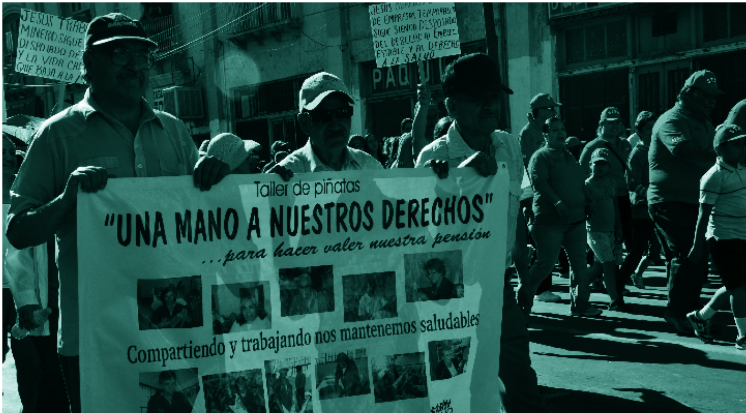
March for a life of dignity

were responsible for 52% of the formal work in the municipality. 225 The same document highlights the importance of the city as a factory center in the country –20% of all workers in the city were employed in these factories in 2006 and 10% in 2009, a figure that reflects the economic crisis in the U.S. and the decreasing demand. 226