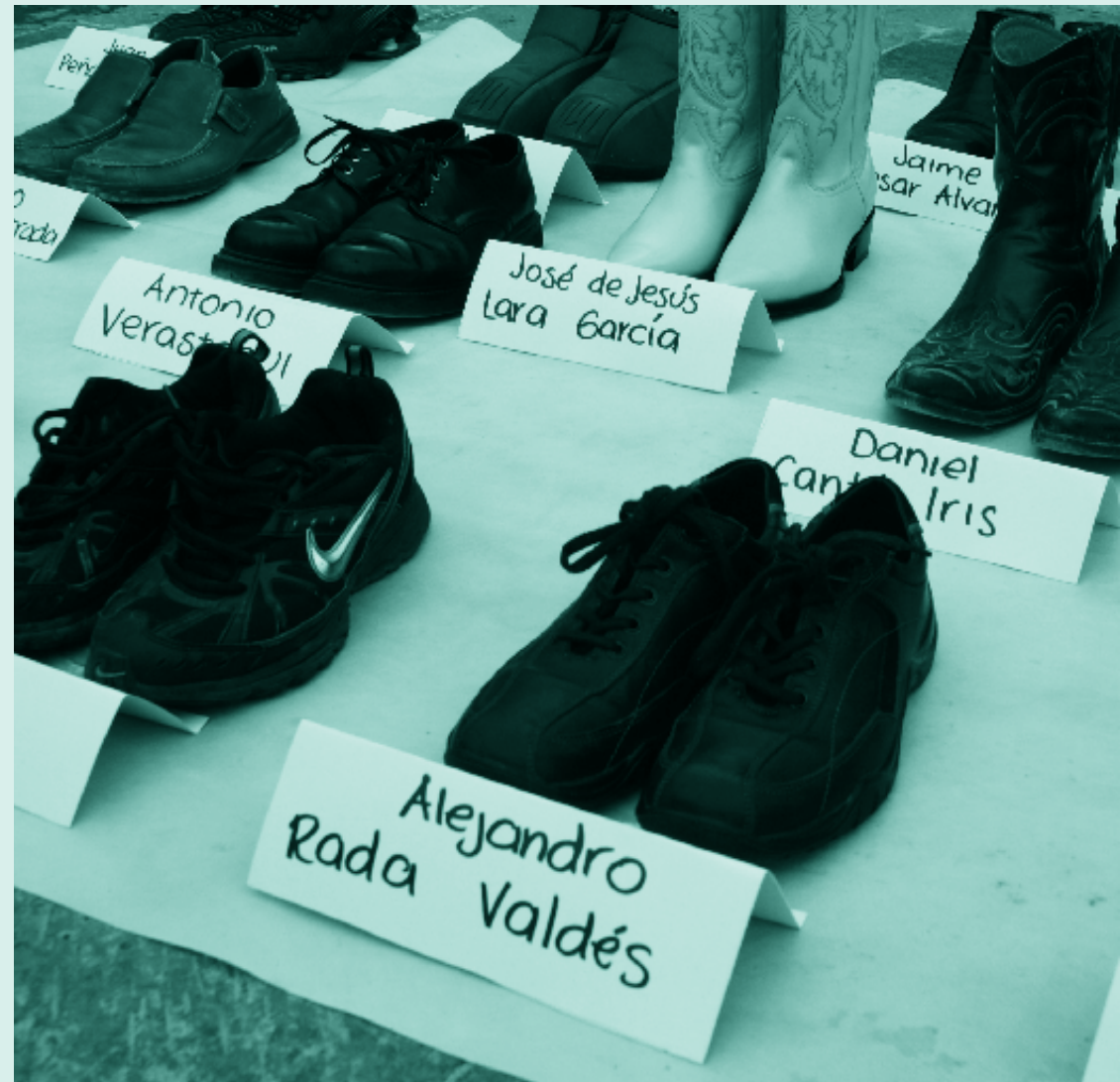
Searching for the disappeared © “Fray Juan de Larios” Human Rights Center raise awareness nationally and internationally, to make the issue more well-known as something that affects the whole population. There are two urgent things that must be done simultaneously: a search for the disappeared and an investigation into the crime.