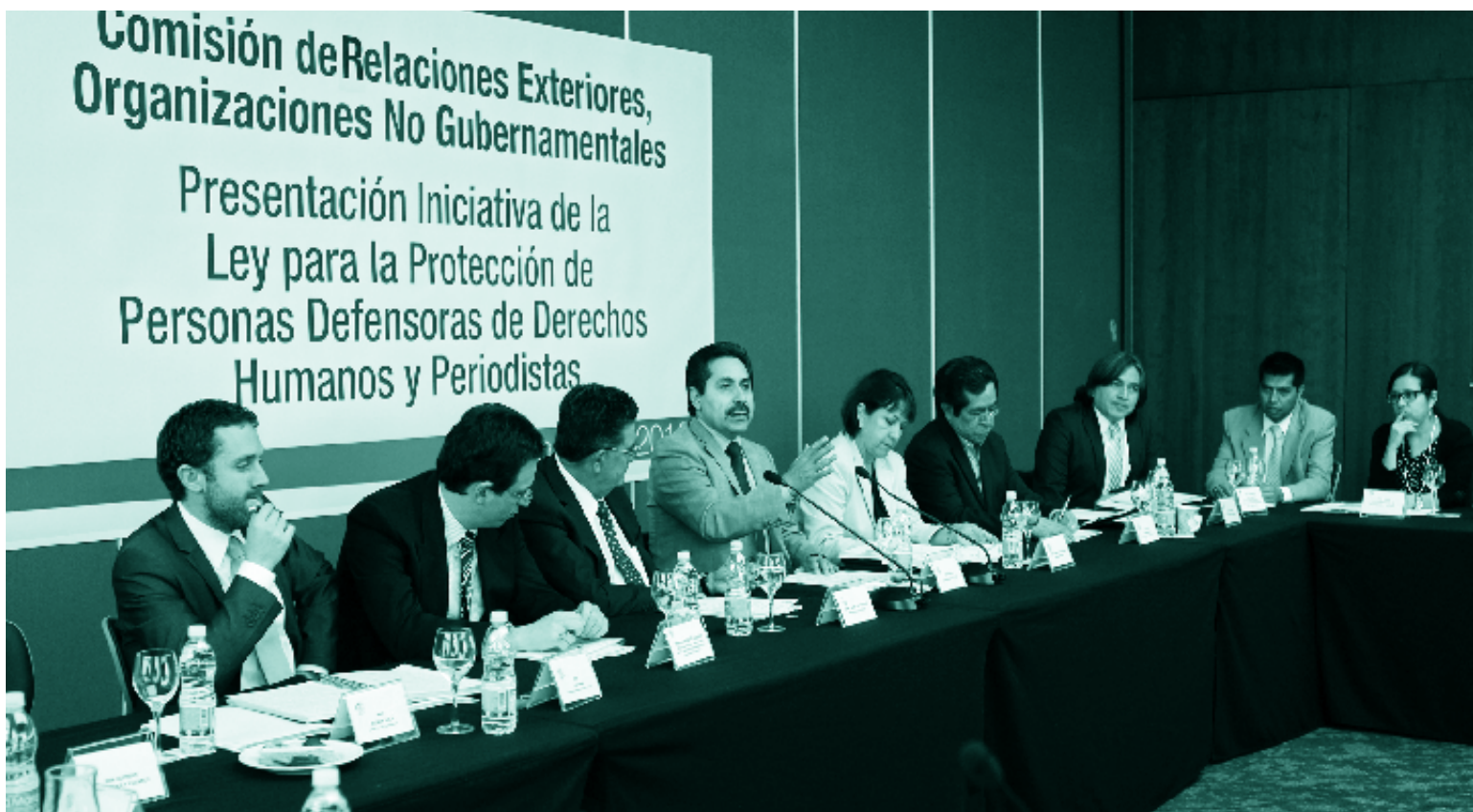
Presentation of the Bill for the Protection of Human Rights Defenders and Journalists